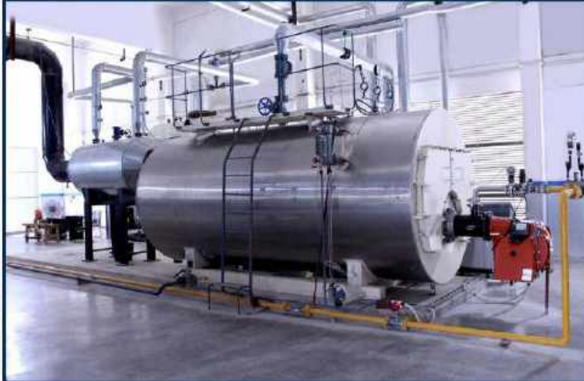
SHUANGLIANG HSB-496H2 Hot Water Chiller