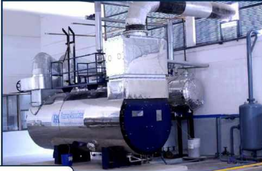
WHR HRB/D-1700/10 Boiler