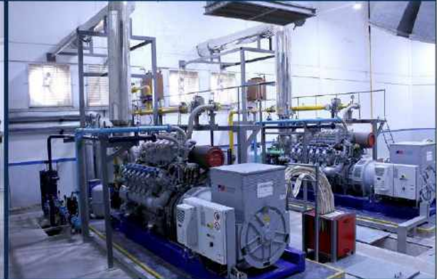
MTU 12V 4000L64 Gas Generator (1521 KW)